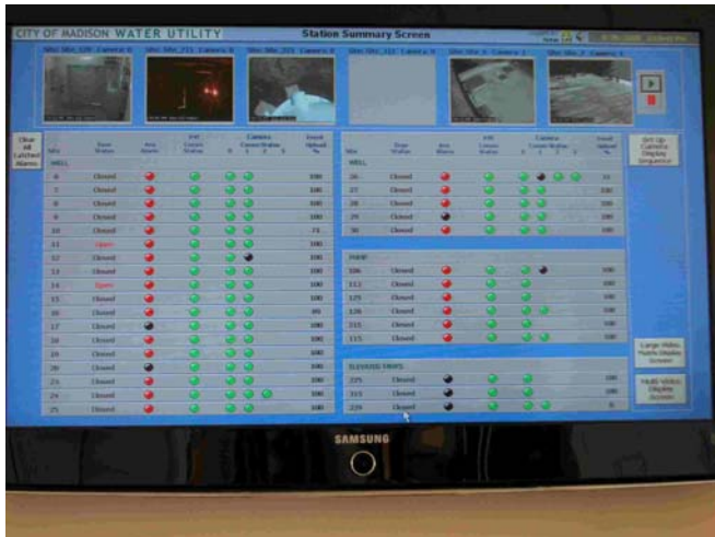
Figure 3: The Station Summary Screen shows the status of all doors, alarms, cameras and wireless systems at 36 remote pump stations, wells, tanks and other facilities.

and manage video clips. The remote sites communicate with the main server via Ethernet radio connection to the HMI computer. MWU is in the process of converting its aging outdated Aquatrol SCADA system to a Wonderware PLC-driven platform. It is expected that this conversion will be completed in the next 18 to 24 months. Once the system is converted, the video surveillance system will interface directly with the Wonderware SCADA system.