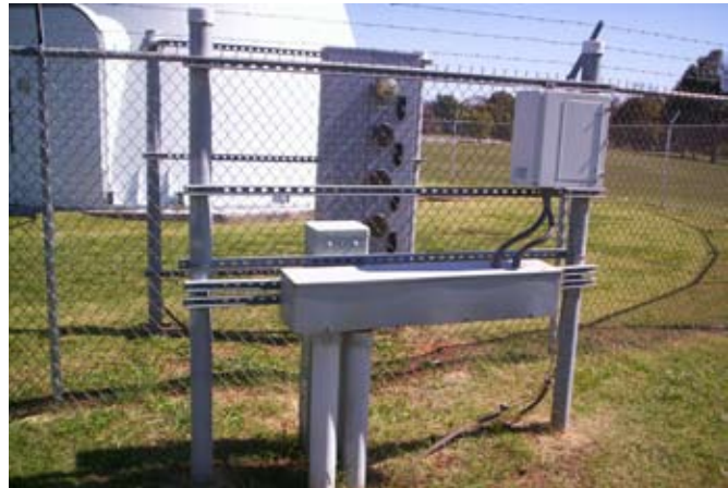
Figure 1: Remote sites, such as this water tower, are ideal locations for using cellular communications to transmit video surveillance images.

While some video systems, such as the Longwatch Video System, are designed for low bandwidth networks, there are still many remote sites, Figure 1, that have insufficient infrastructure, obsolete technologies or high levels of proprietary technology, making it difficult for even Longwatch to operate effectively. These include DC telephone circuits, tone (FSK) communications, proprietary radio networks, extremely slow networks (300 bps), and others.