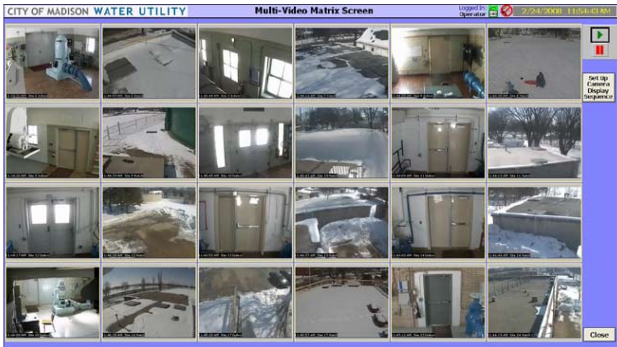
Figure 4: Instead of watching live video from these 24 remote sites, this water company schedules each site to send a short video clip every five minutes. If any site detects an intruder or an alarm, it can switch to live video immediately.

If cost is a consideration, video transmission can be configured so that images from remote sites are sent at lengthy intervals; say, a single image from the camera sent once every five minutes, Figure 4. This gives the operator an updated view of the remote site without utilizing large amounts of bandwidth. If an alarm occurs, video can instantly change from sending these static images to live streaming video transmission. In addition, the remote video archiving capability of Longwatch ensures that all video is available on request.