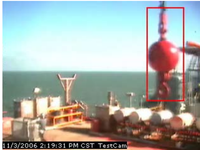
Figure 3: Modern digital video cameras and the Longwatch system can identify anomalies in the image, sound an alarm, and switch to live video mode. Here, the Longwatch system spots a swinging crane hook passing its field of view, puts a red “box” around it, and tracks it across the image. With capabilities like this, there is no need to send video continuously over a cellular connection.

Cellular connections, however, are not 100% reliable. Fortunately, Longwatch remote systems can operate in stand-alone mode if a cellular connection is lost, continuously monitoring alarms and capturing and archiving video without a network connection. When the cellular connection is eventually re-established, operators can view video taken during the outage as well as review any remote alarms or conditions that may have occurred.