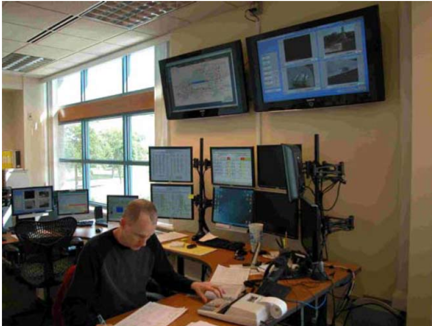
Figure 1: Video from 32 remote sites is sent via wireless to the central control room at the Madison Water Utility in Madison, Wisconsin. The video uses the same wireless link as the SCADA and access control system, and the video images appear on a Wonderware HMI system.

While this is a high level synopsis of the challenges Madison faced, many municipalities still face these same obstacles. Our experience shows that video security surveillance is possible over an existing SCADA network (Figure 1) at a reasonable cost, and that funding is available to cover most of the expense.