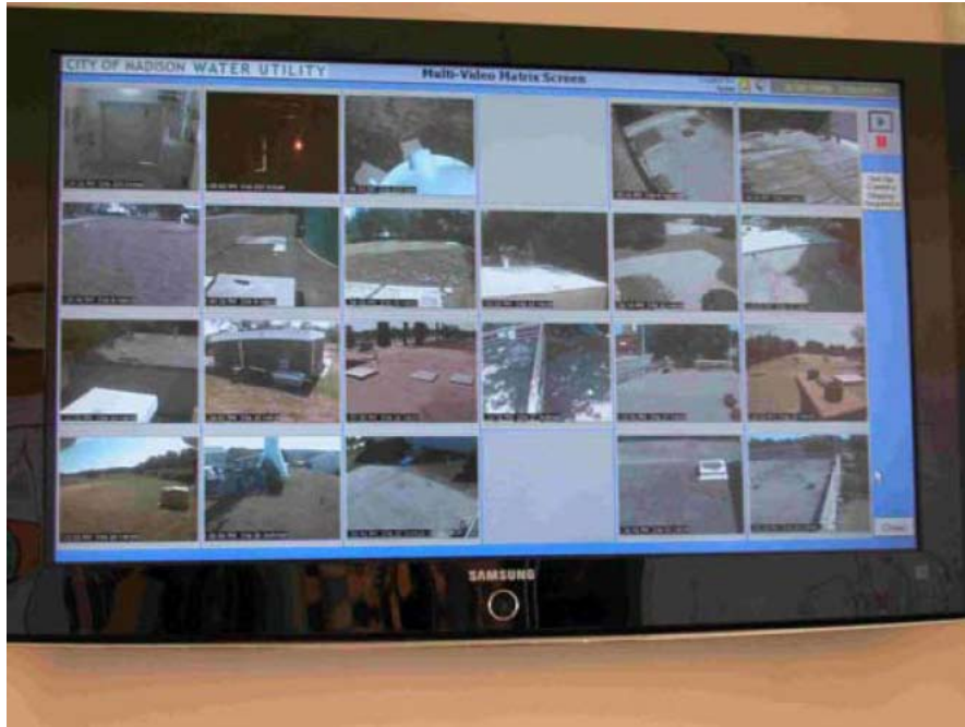
Figure 2: This screen shows up to 24 still images from remote sites at one time. Each image is updated every 20 minutes. If an alarm occurs, the operator receives a 15-second video clip of the incident and can switch to live video at any time.

MWU requested a price proposal from Longwatch in July of 2007. As part of this proposal, Longwatch gave Madison a guarantee: If Madison can assure Longwatch 50kb/sec bandwidth on the radios, the guard tour mode would produce an update from each and every camera at least every twenty minutes (Figure 2). The Longwatch system would also produce 25 video event clips per hour (5 seconds in length and 3 frames per second) from around the network.