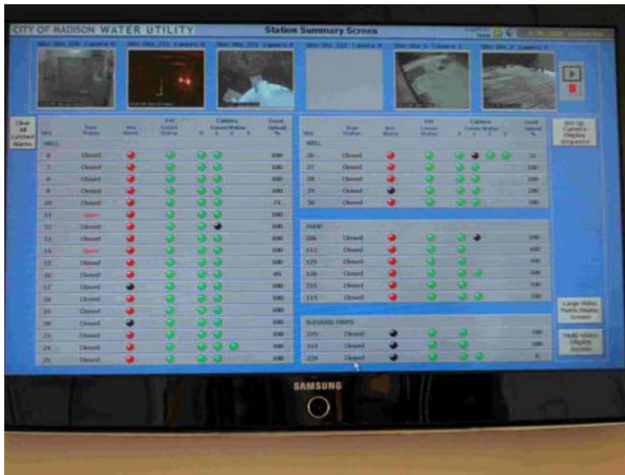
Figure 3: The Station Summary Screen shows the status of all doors, alarms, cameras and wireless systems at 36 remote pump stations, wells, tanks and other facilities.

The video surveillance system uses a Wonderware HMI to allow the operator to monitor alarms, and view and manage video clips. The remote sites communicate with the main server via Ethernet radio connection to the HMI computer. MWU is in the process of converting its aging outdated Aquatrol SCADA system to a Wonderware PLC-driven platform. It is expected that this conversion will be completed in the next 18 to 24 months. Once the system is converted, the video surveillance system will interface directly with the Wonderware SCADA system.